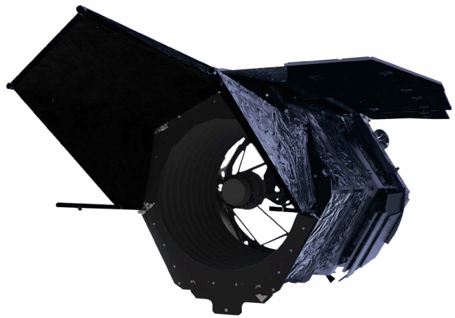
NASA's Nancy Grace Roman Space Telescope