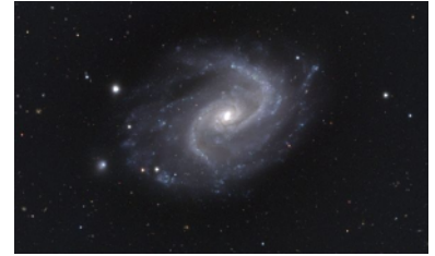
PS1 3-color image of NGC 894

PS1 took approximately 370,000 exposures from 2010 to 2015, each exposure consisting of 60 CCD images. These exposures are detrended, astrometrically calibrated, resampled (warped) onto a standard sky coordinate grid, stacked, and differenced. The different types of images are described below. More details about image filenames and data formats are included in the description of the PS1 Image Cutout Service .