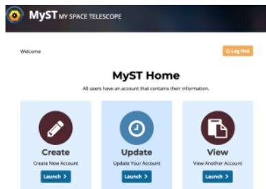
MyST action panel after login

Principal Investigators (PIs) for approved observing programs with HST or JWST are automatically authorized to access data from their program(s).